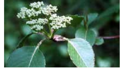
NANNYBERRY ( Viburnum lentago )

Grows wider than tall. White flowers in spring, orange - red foliage in fall. Excellent stabilizer of dry, sandy soil. Edible fruit, attracts birds and bees.