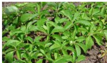
VIRGINIA CREEPER ( Parthenocissus quinquefolia )

High climbing vine with red, tubular flowers that bloom in late spring/early summer. Attracts birds, hummingbirds, and butterflies.