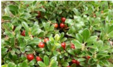
BEARBERRY ( Arctostaphylos uva-ursi )