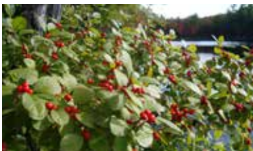
WINTERBERRY ( Ilex verticillata )

Evergreen shrub with small greenish white flowers in early summer and black berries in fall.