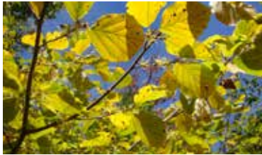
COMMON WITCH HAZEL ( Hamamelis virginiana )