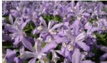
CRESTED IRIS ( Iris cristata )

Evergreen, blue-green foliage. Easy to grow, spreading plant.