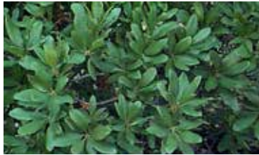
NORTHERN BAYBERRY ( Myrica pensylvanica )

Deciduous shrub with small yellow flowers in spring before the foliage emerges. Red fruit and yellow foliage provide color in fall.