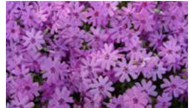
MOSS PHLOX ( Phlox subulata )