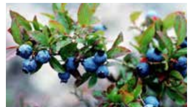
LOWBUSH BLUEBERRY ( Vaccinium angustifolium )

Easy to grow, mat forming ground cover with needle like foliage. Blooms in spring with pink, lavender, or white flowers.